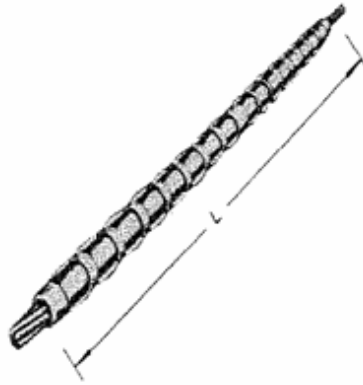
ACSR AND ALL ALUMINUM