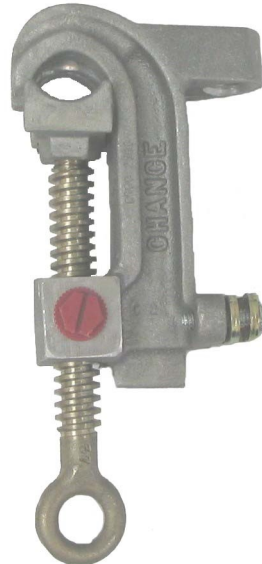
PINCE VERSATILE / VERSATILE CLAMP